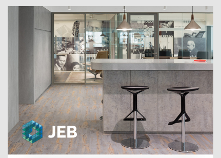
CREATING SPACES WE LOVE