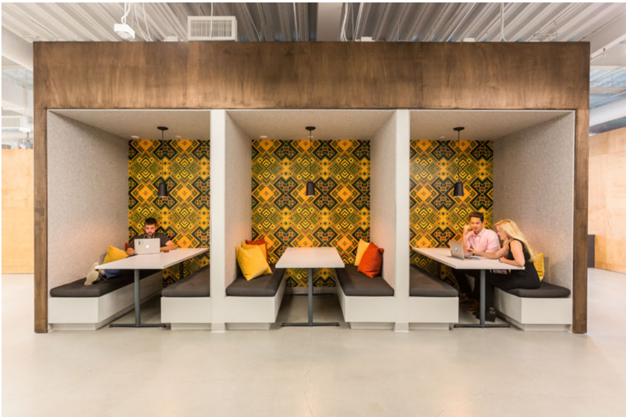
Booths with vibrant wallpaper serve as meeting areas.