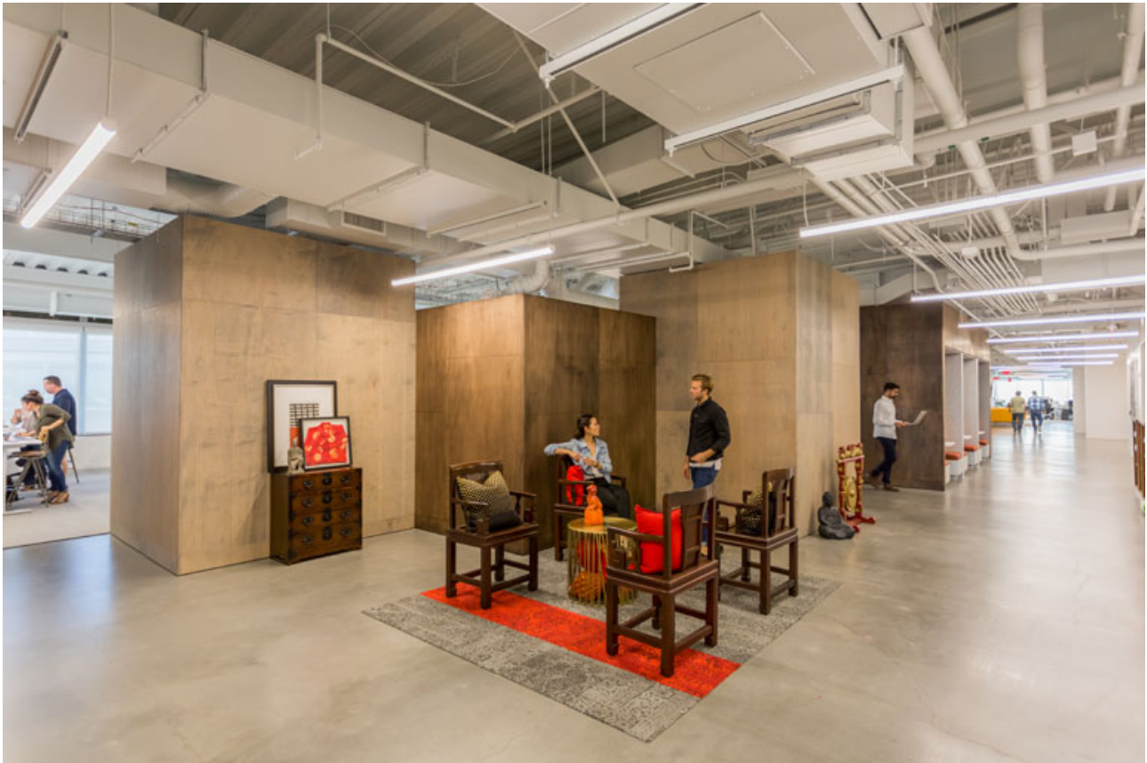
A break-out area features vintage furniture.