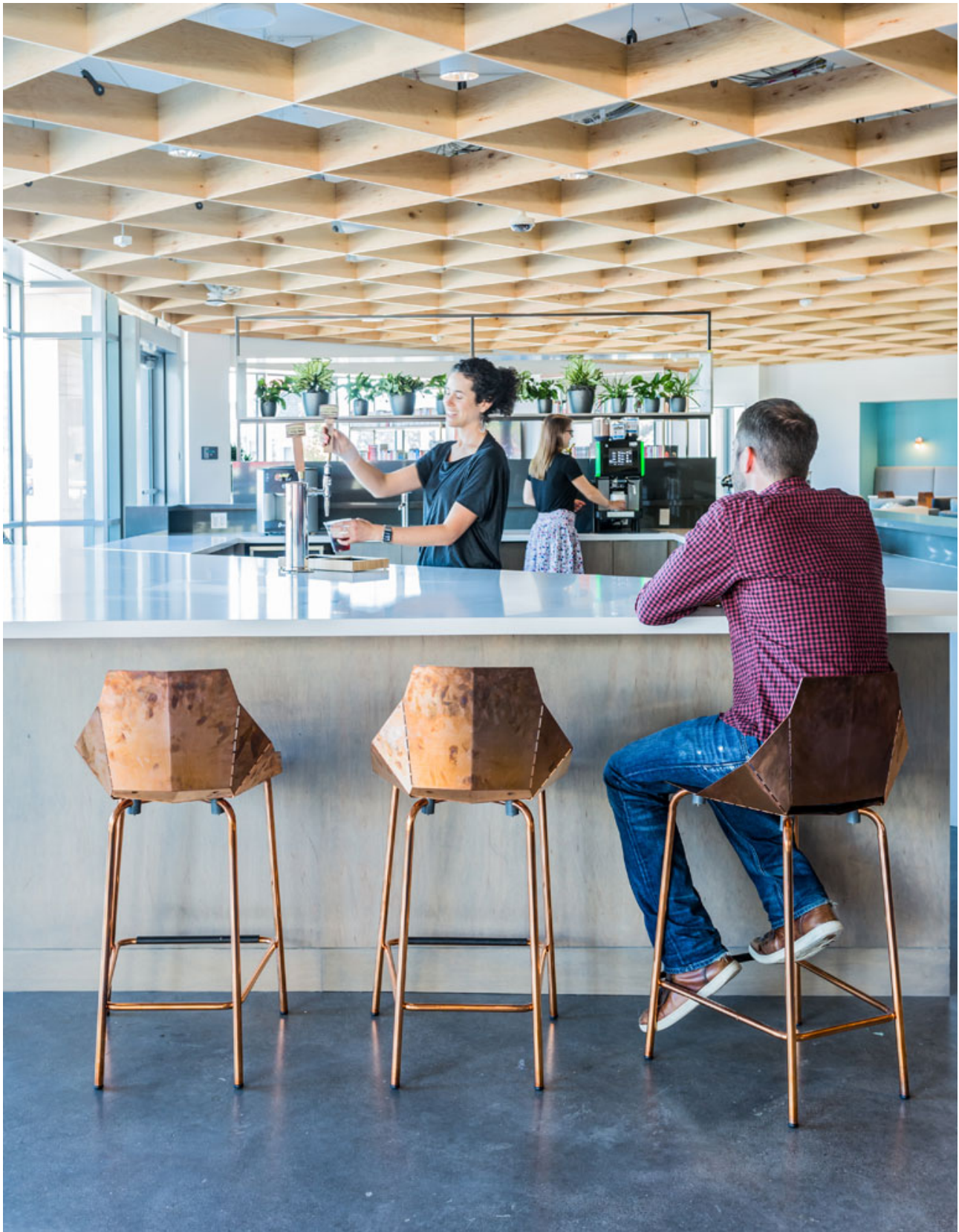
Barstools are copper-plated steel.