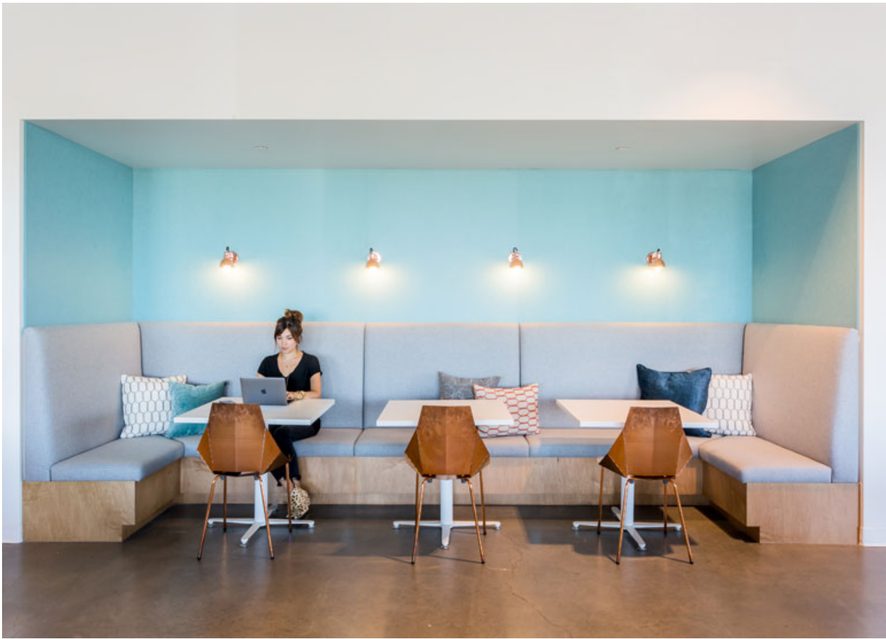
Acoustic panels absorb sound in a work area.