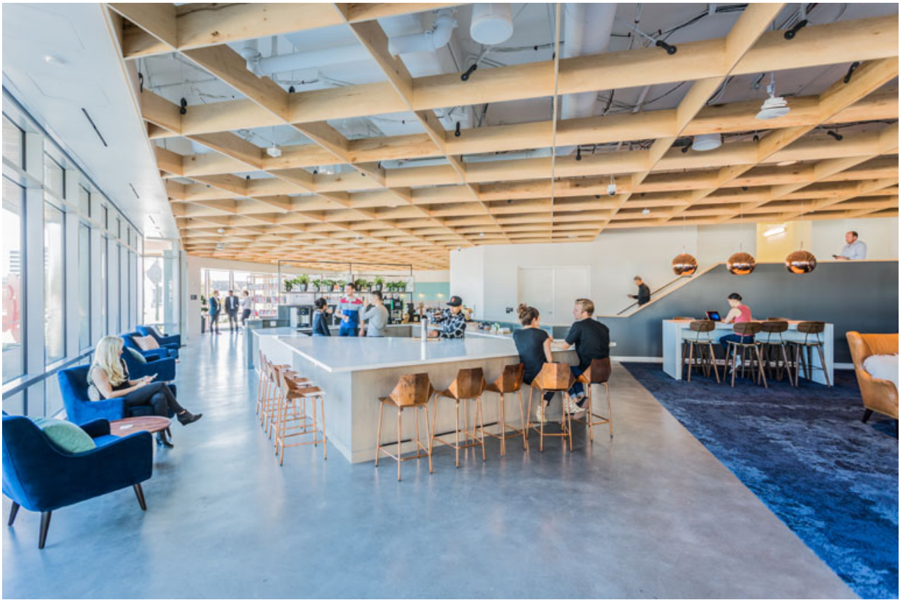
An expansive coffee bar on the ground floor.