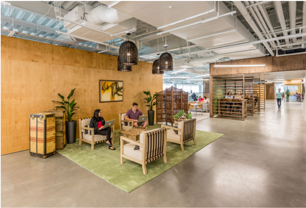
The office was inspired by cities around the globe.