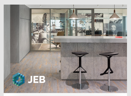
CREATING SPACES WE LOVE