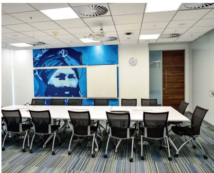
One of the meeting rooms with an Indian artwork

The company also focusses on promoting awareness towards the environment; the common areas make abundant use of natural light while there is also an organic waste converter on the campus to help in recycling the waste. It is among one of the few offices that has LEED certification, given the usage of materials used inside the office are low on toxicity and have zero carbon footprint.