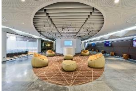
A common breakout area in green

Bangalore Mirror Bureau | Apr 11, 2016, 08.26 PM IST